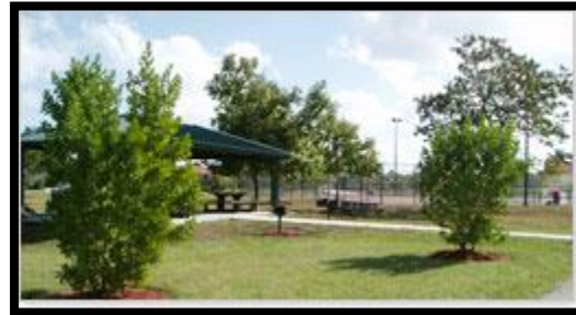
Camelot Park 1718 SW 52nd Terrace Cape Coral, FL 33914