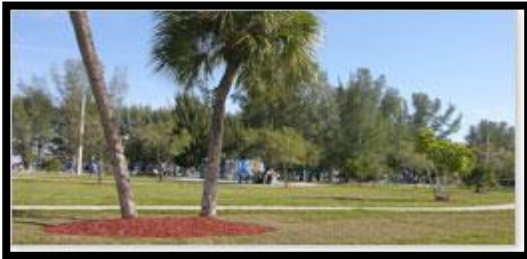
Jaycee Park 4125 SE 20th Place Cape Coral, FL 33904