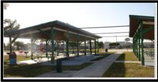
Giuffrida Park 1044 NE 4th Street Cape Coral, FL 33909