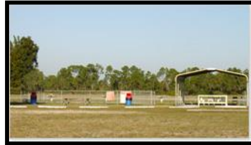
Seahawk Park 1030 NW 28th Terrace Cape Coral, FL 33993